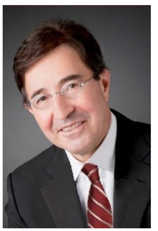
The Vascular Birthmark Institute

vascular malformations, are surprisingly complex conditions. You cannot just "cut them off." They contain a massive tangle of blood vessels. One misstep, and the patient could bleed to death.